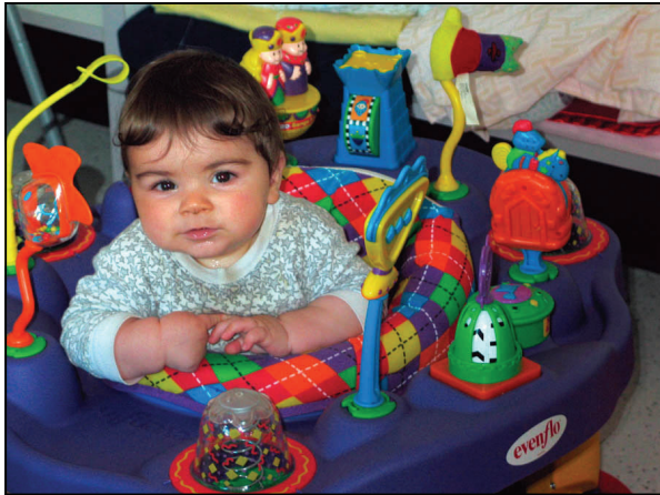
Young Resident at the Letty Owings Center

In 1997, the Letty Owings Center became a program of Central City Concern.